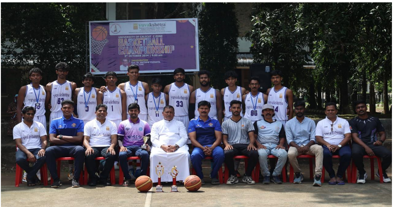
The YIMS Basketball Team has achieved the Runner Up in the C Zone Championship